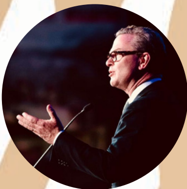
The Hon Christopher Pyne Australian Co-Chair

We thank all our members and special guests for their participation. We look forward to welcoming you on our next delegation.